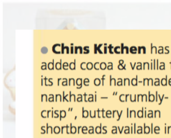
Hilla Hamlin adds biscuit bliss